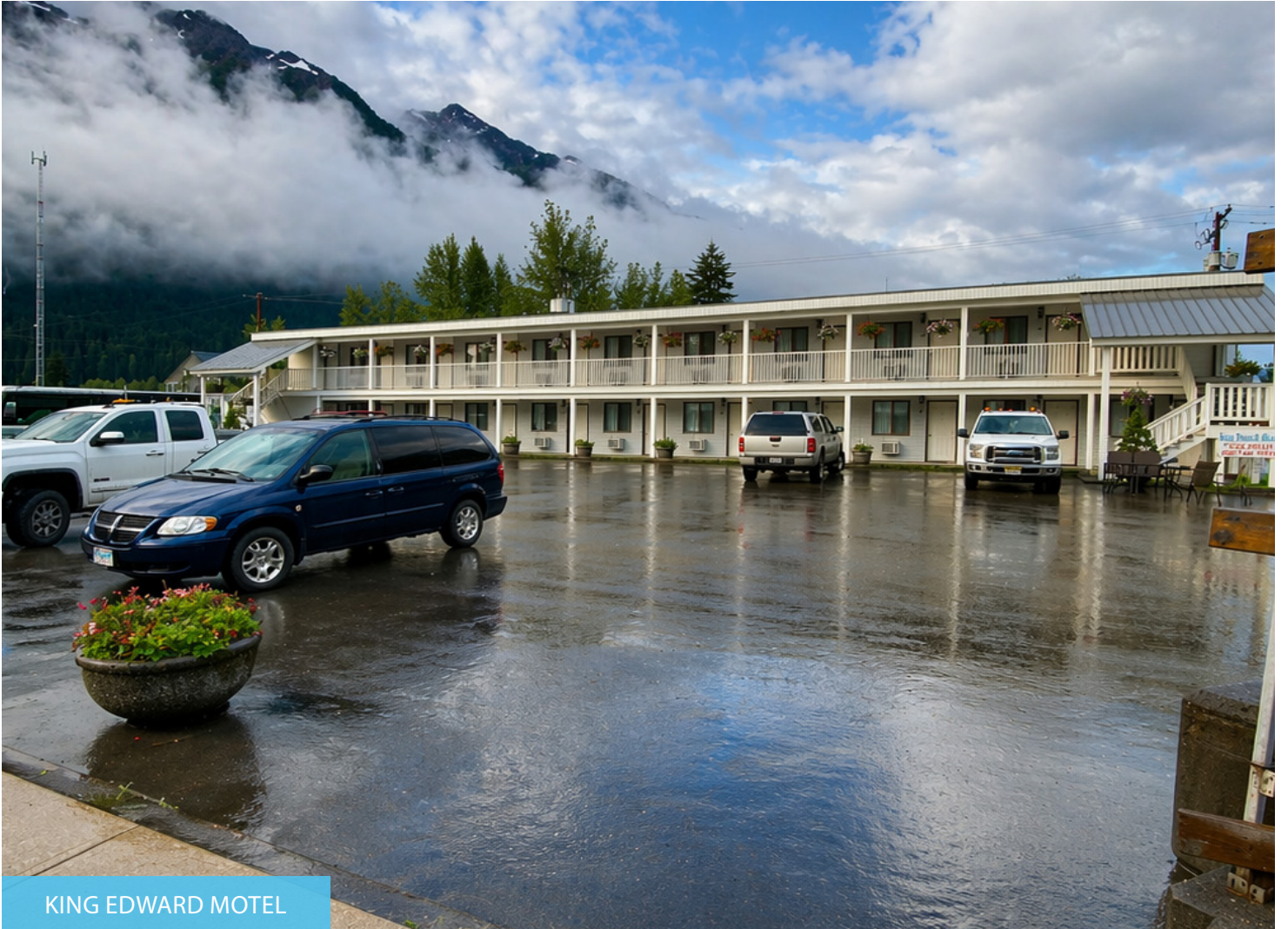
KING EDWARD MOTEL