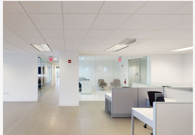
SUITE SIZES: 87 RSF - 5,778 RSF