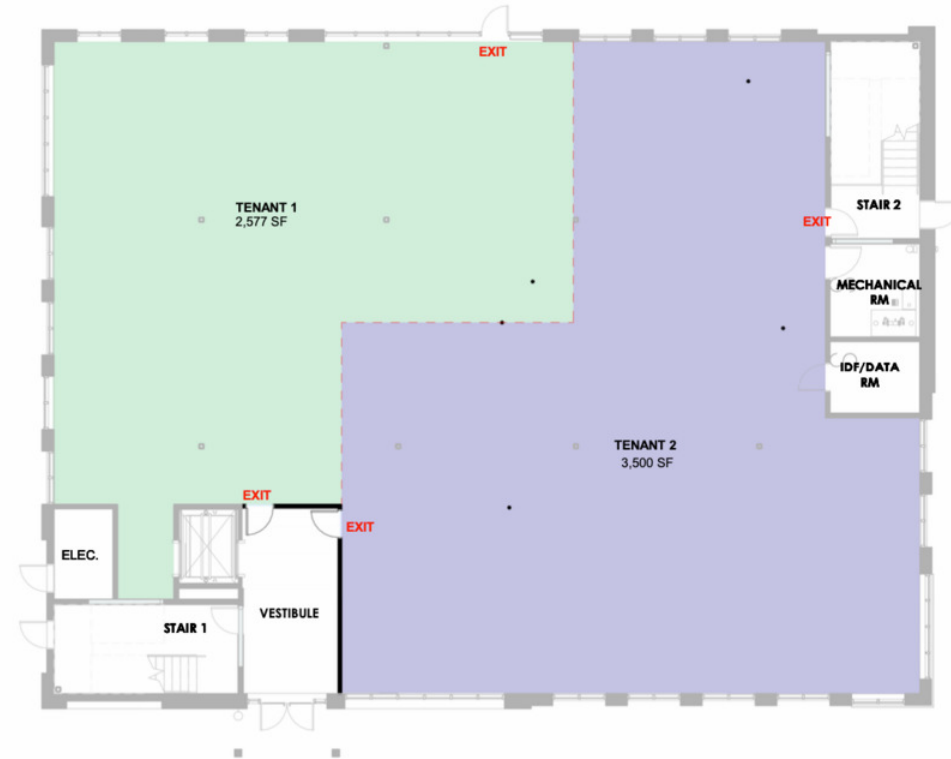
1 FIRST FLOOR PLAN SD-22A SCALE: 1/16" = 1'-0"