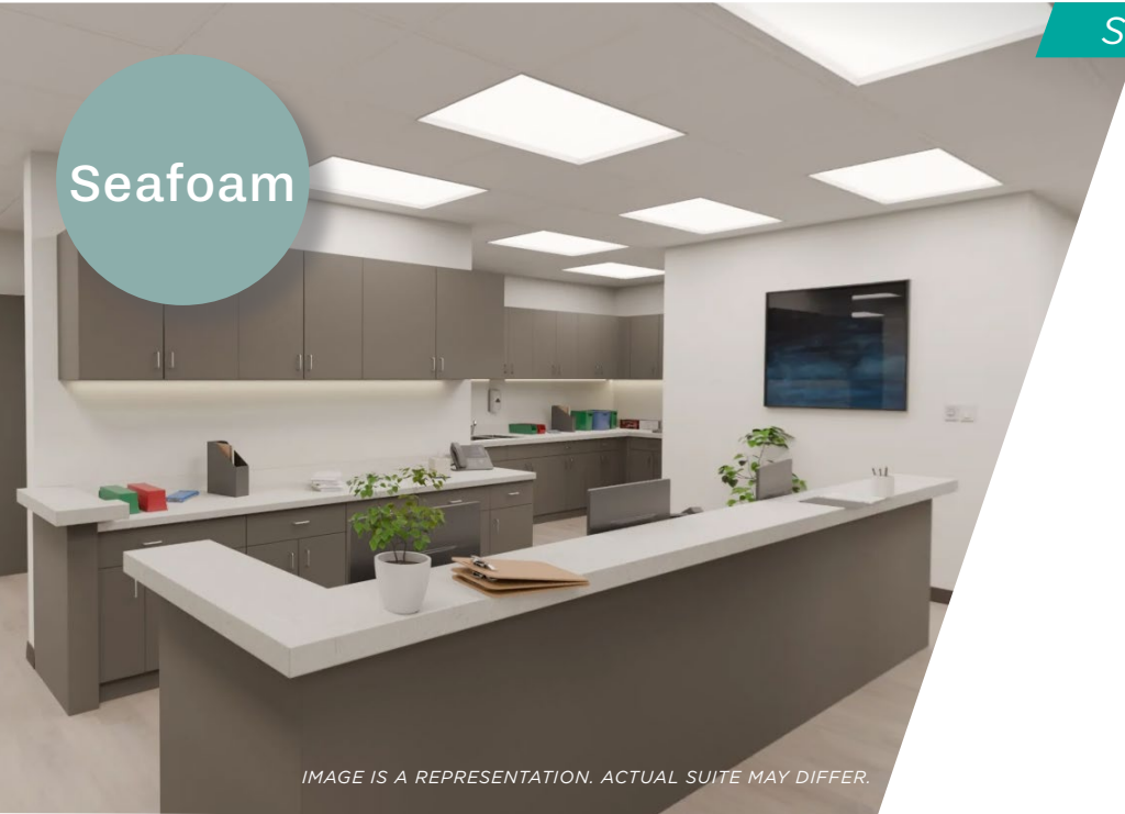
IMAGE IS A REPRESENTATION. ACTUAL SUITE MAY DIFFER.