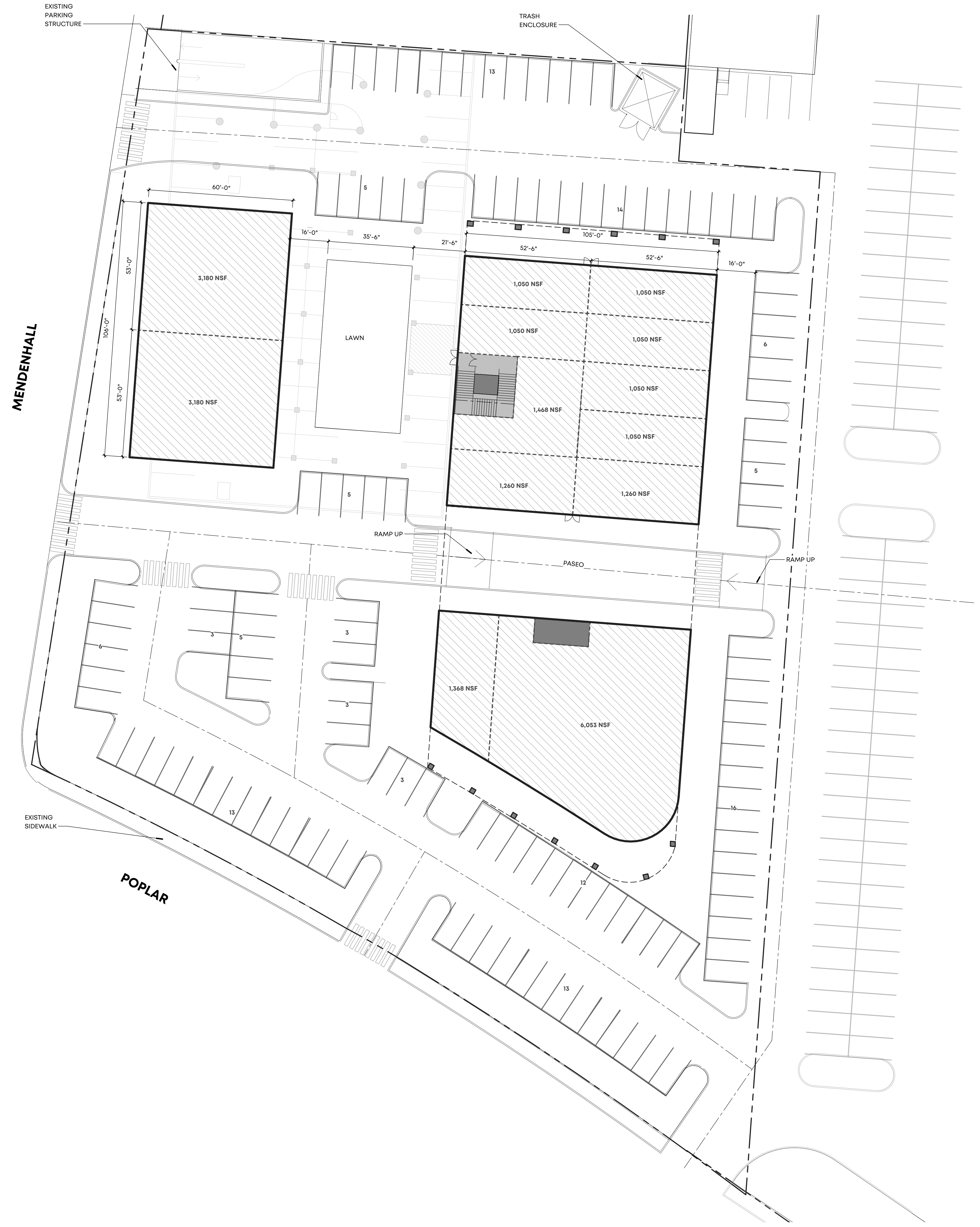
1 SITE PLAN - GROUND FLOOR (B) SCALE: 1" = 20'-0"