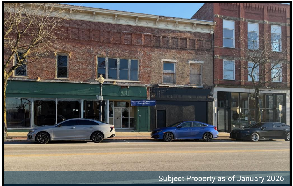
Subject Property as of January 2026

New tenants in the area include Vinyl Coffee, Heart State Living & Bar 142, Scotty's 22-Brew, Crumbs Up Cookies & Cakes, Level Up Arcade & Bar, Starlight Pizza & Subs, Break-A-Way Billiards