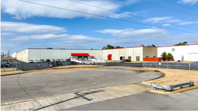
Cypress Woods Lane Entrance