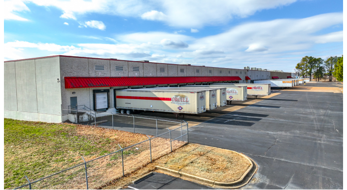
Wildwood Drive Truck Court