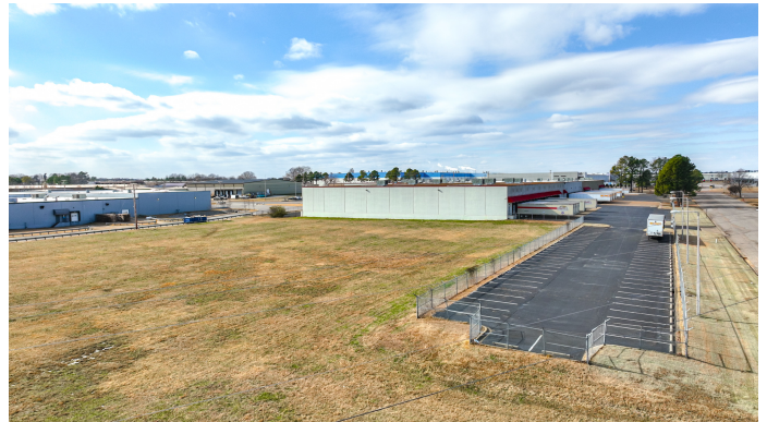
Vacant lot at Deerfield and Wildwood Drive