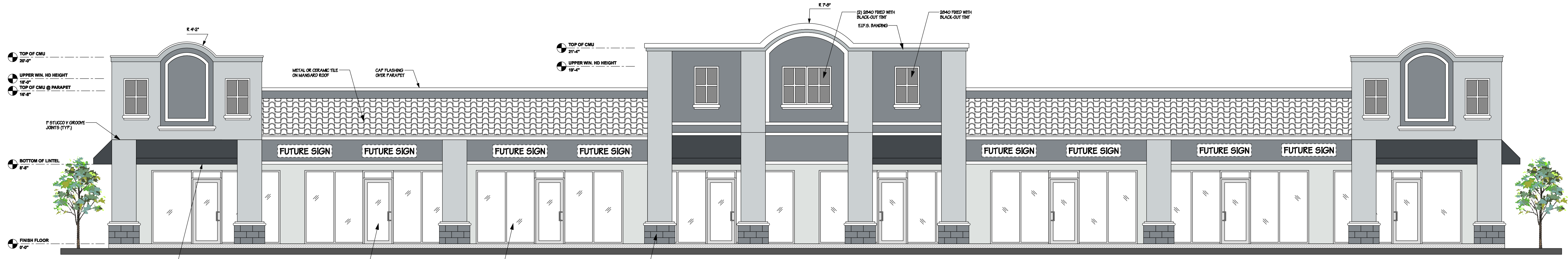
1 EAST ELEVATION SCALE: 3/16" = 1'-0"