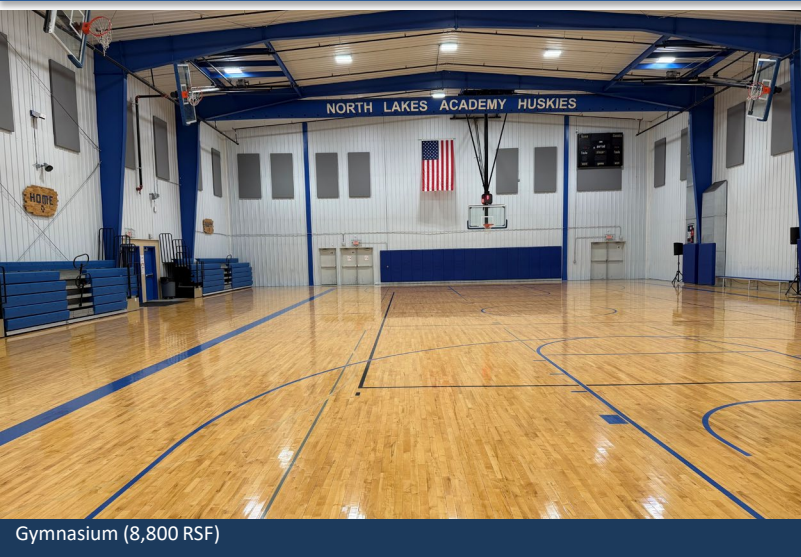
Gymnasium (8,800 RSF)