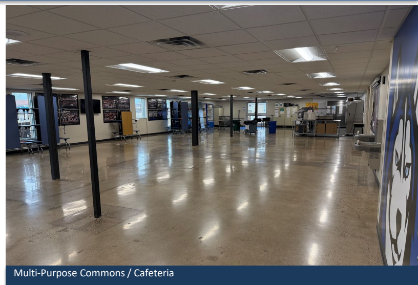
Multi-Purpose Commons / Cafeteria