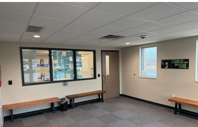
Main Entrance Lobby