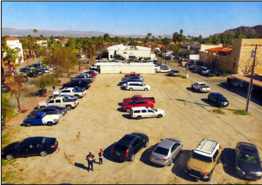
EAST VIEW OF LOTS AND TWO BUILDINGS