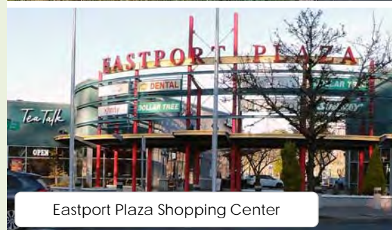
Eastport Plaza Shopping Center

The area offers outdoor recreation, including Powell Butte Nature Park with extensive trails and open green space. Combined with neighborhood parks and quiet residential streets, the community supports an active lifestyle. Continued investment, a diverse population, and a community-oriented atmosphere make Powell Hurst-Gilbert a durable rental submarket capable of supporting modern multifamily housing, as evidenced by recent strong lease-up performance.