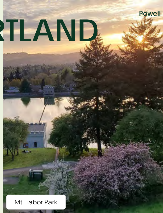
Mt. Tabor Park

Powell Heights & Powell Place are located in the Powell Hurst-Gilbert neighborhood of Southeast Portland, adjacent to the emerging Foster-Powell area. This primarily residential submarket is experiencing steady reinvestment and new multifamily development. The neighborhood features a mix of single-family homes and multifamily communities, offering a quiet residential setting with convenient access to major commercial corridors. Renters are attracted to modern housing at a relative value compared to Portland's urban core, with limited nearby high-end competition providing a unique living experience.