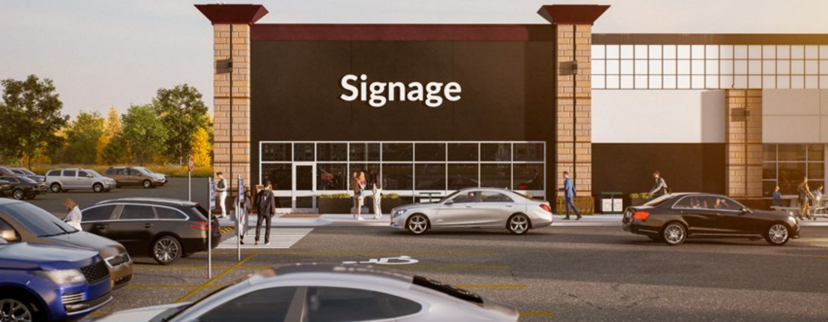
Concept Rendering - East Elevation