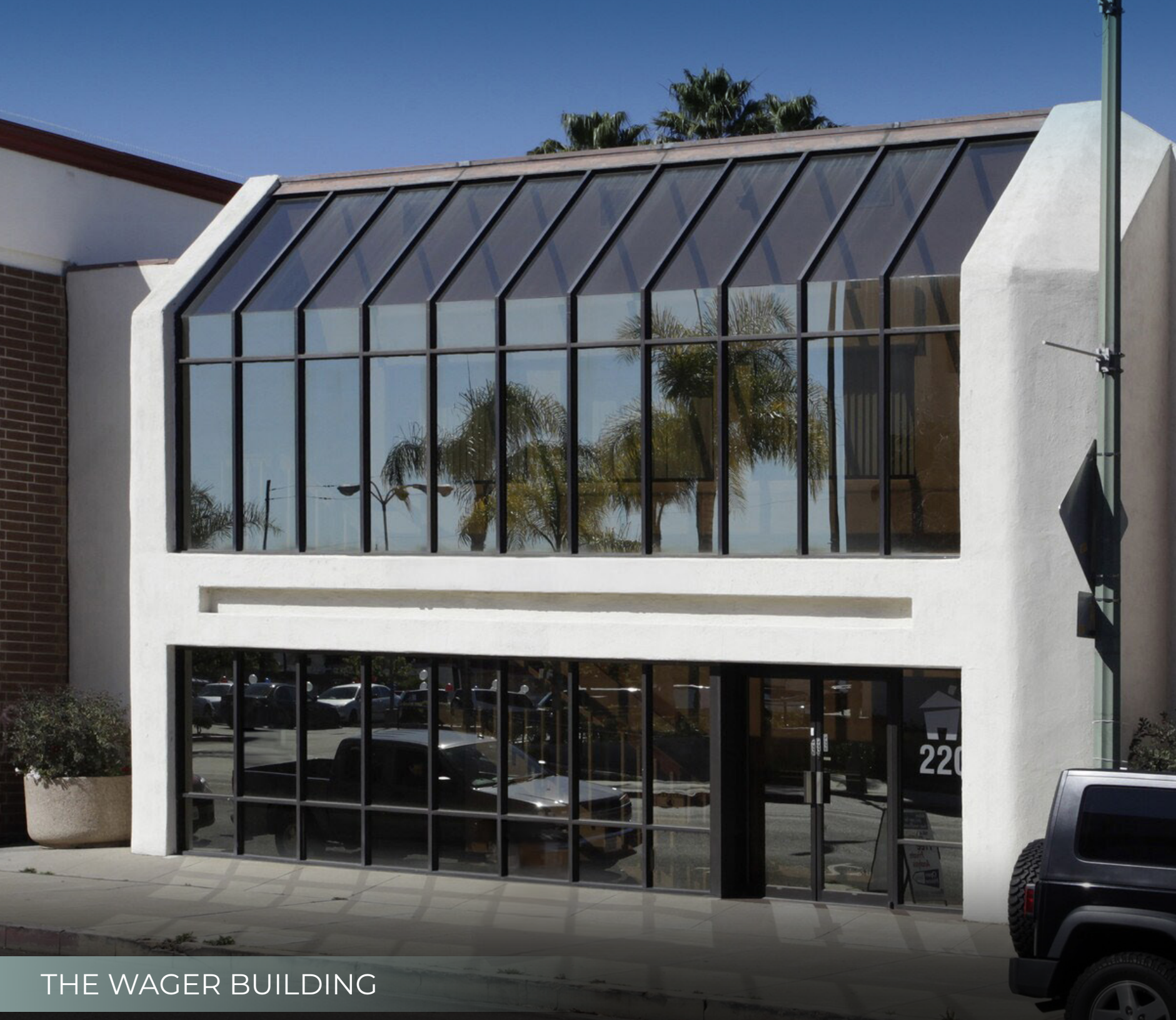
THE WAGER BUILDING