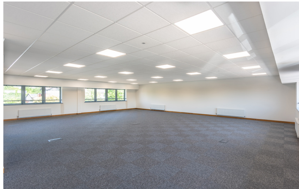
Images show indicative spec from an alternative suite