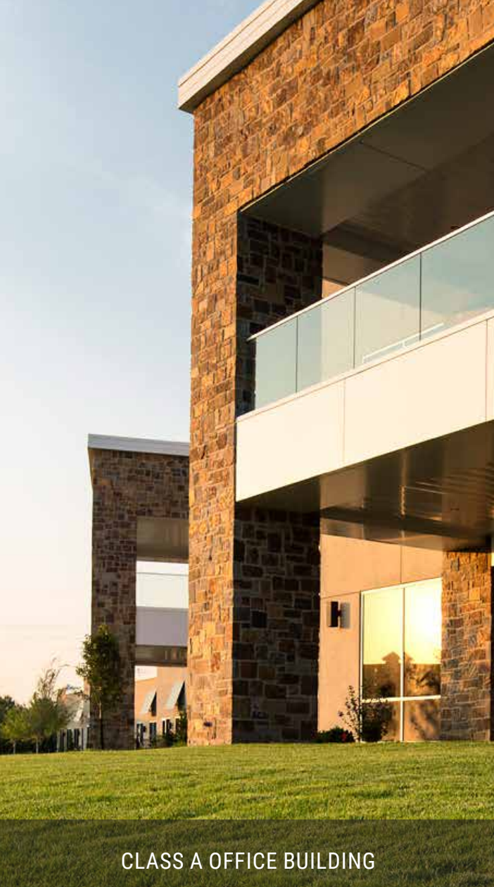
CLASS A OFFICE BUILDING