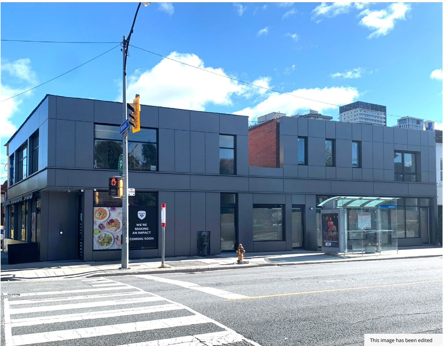
This image has been edited