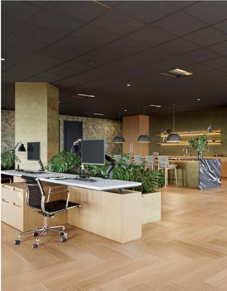
*Photos display hypothetical buildout