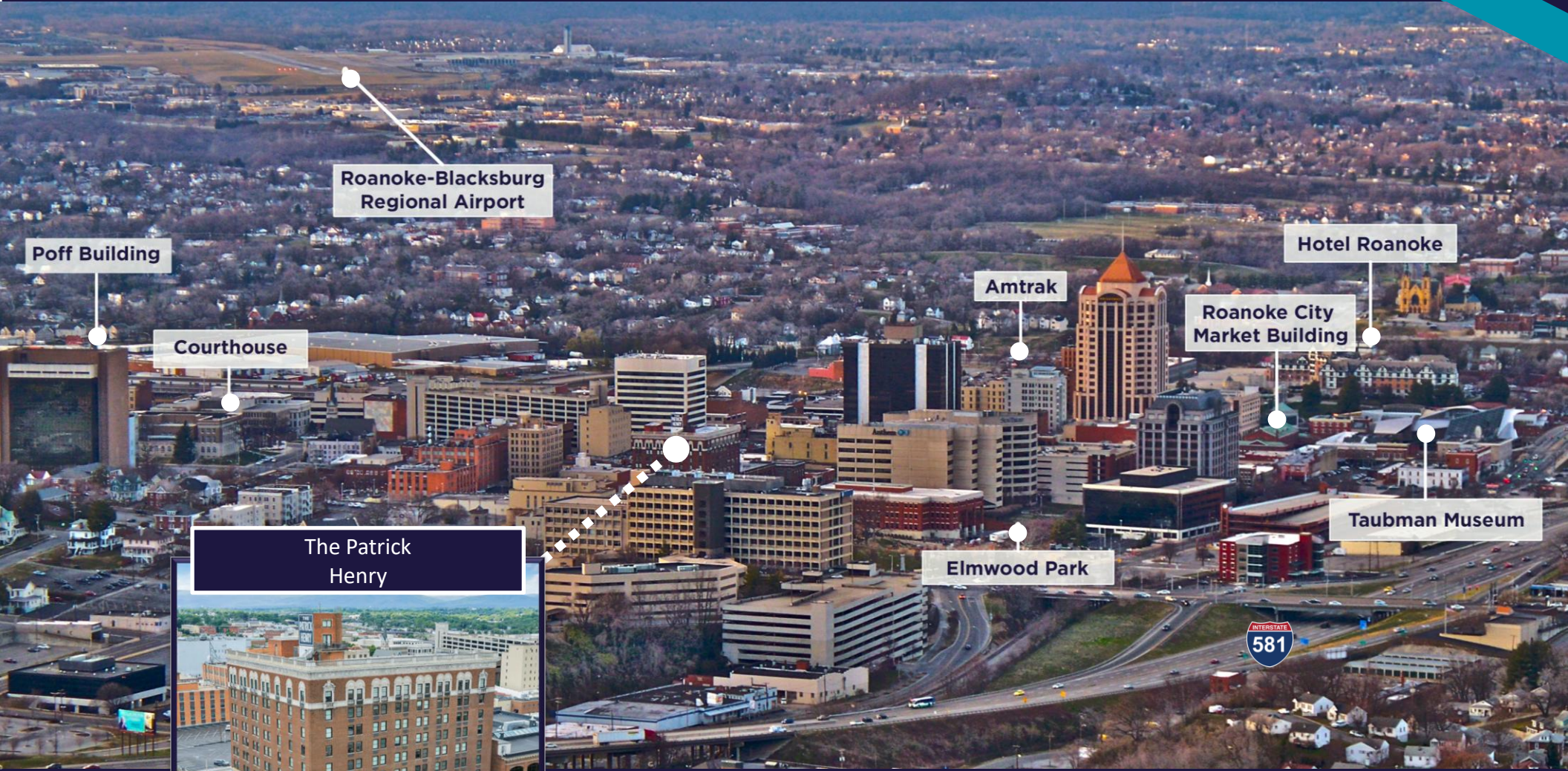
Roanoke-Blacksburg Regional Airport