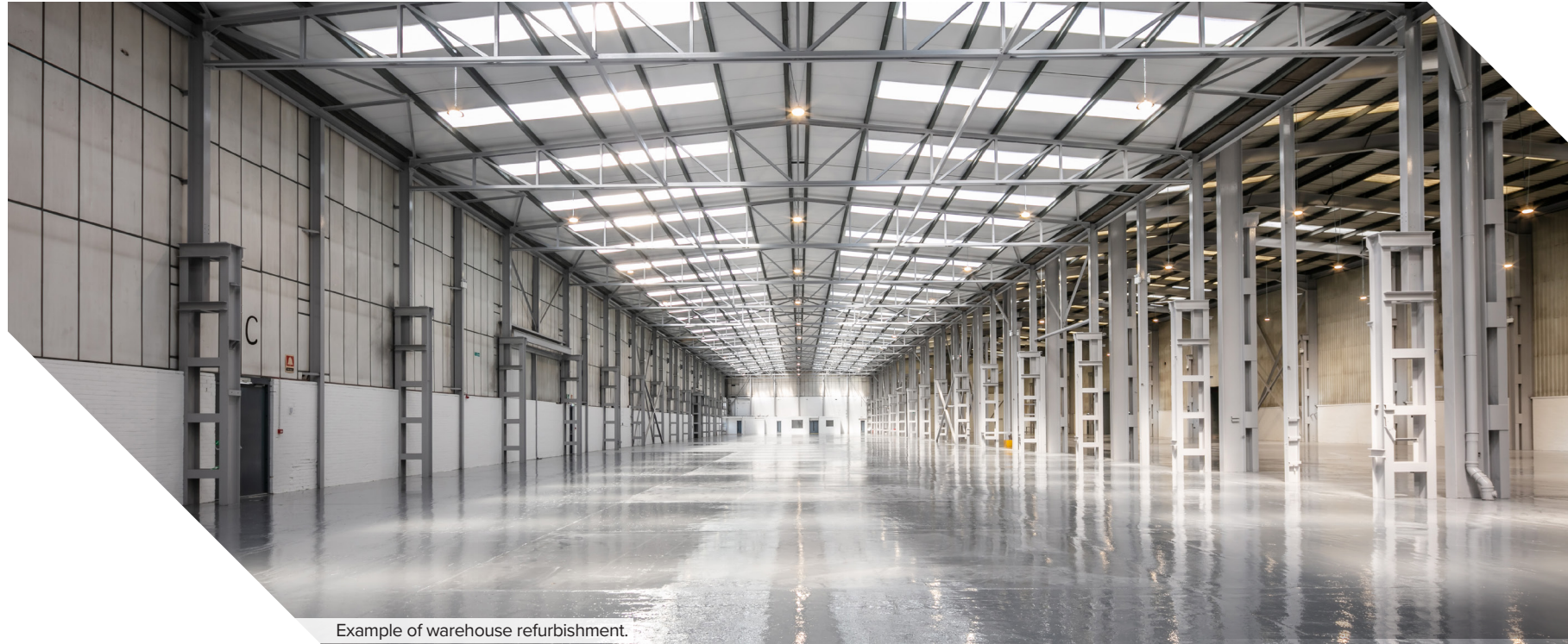
Example of warehouse refurbishment.