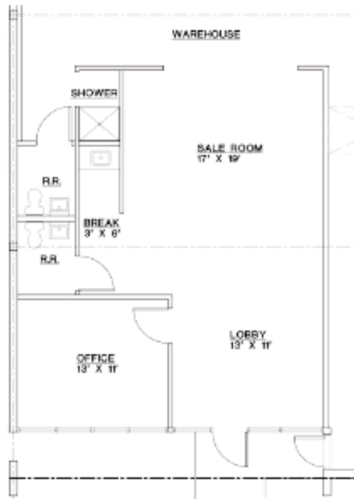
ENLARGED OFFICE PLAN 1/8" = 1'-0"