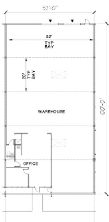
AVAILABLE SPACE PLAN N.T.S.