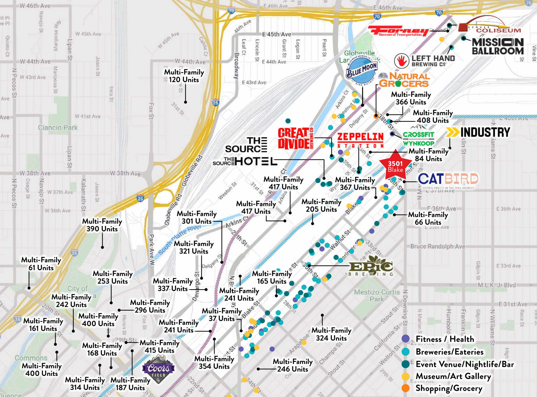
This information has been obtained from sources believed reliable. We have not verified it and make no guarantee about it.