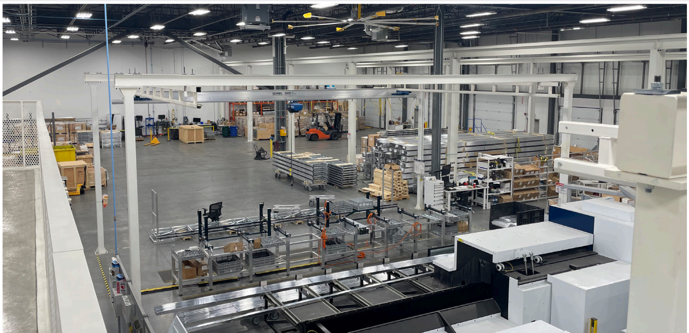
*Cranes to be removed

Dream Industrial is an innovative and customer-focused owner, operator, and developer of high-quality industrial properties. Dream Industrial invests in and manages over 71 million square feet of industrial assets in Canada, Europe, and the United States for over 1,500 occupiers operating across a diversity of sectors. The organization has a track record of delivering best-in-class modern industrial properties globally, with a development pipeline that includes approximately 6 million square feet of active projects and an additional 7 million square feet available for expansion or built-to-suit purposes.