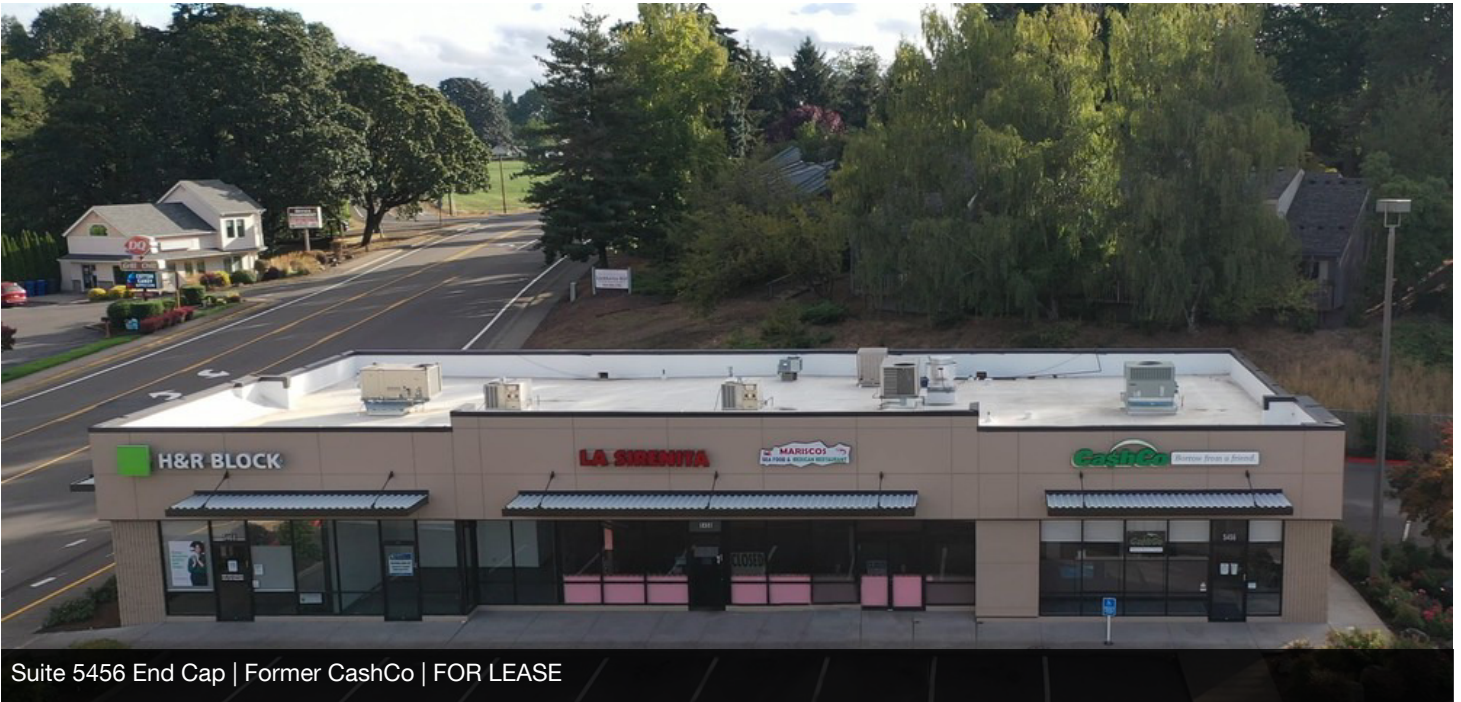
Suite 5456 End Cap | Former CashCo | FOR LEASE

Shadya Jones (503) 884-6281 Shadya@ShadyaJones.com