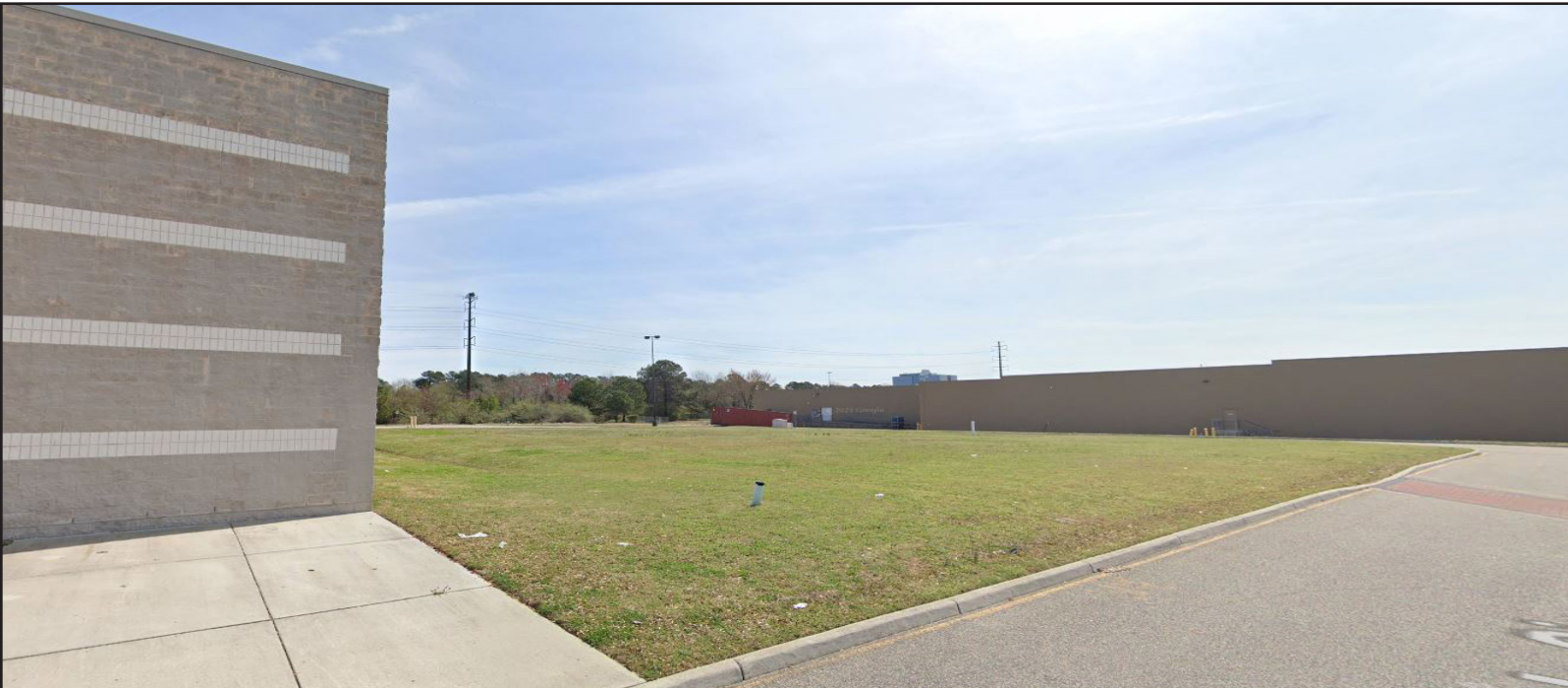
Land Parcel | 1537 Sam's Circle , Chesapeake, VA