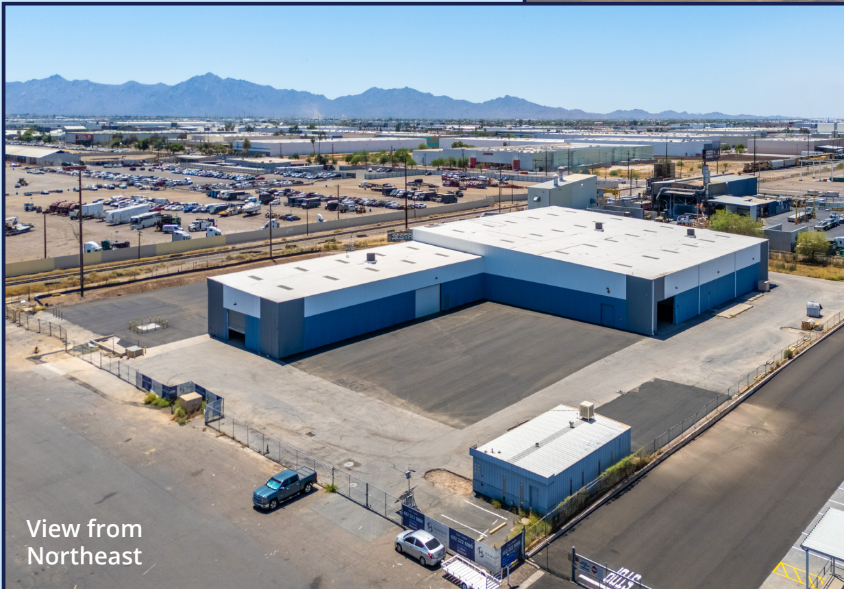
View from Northeast