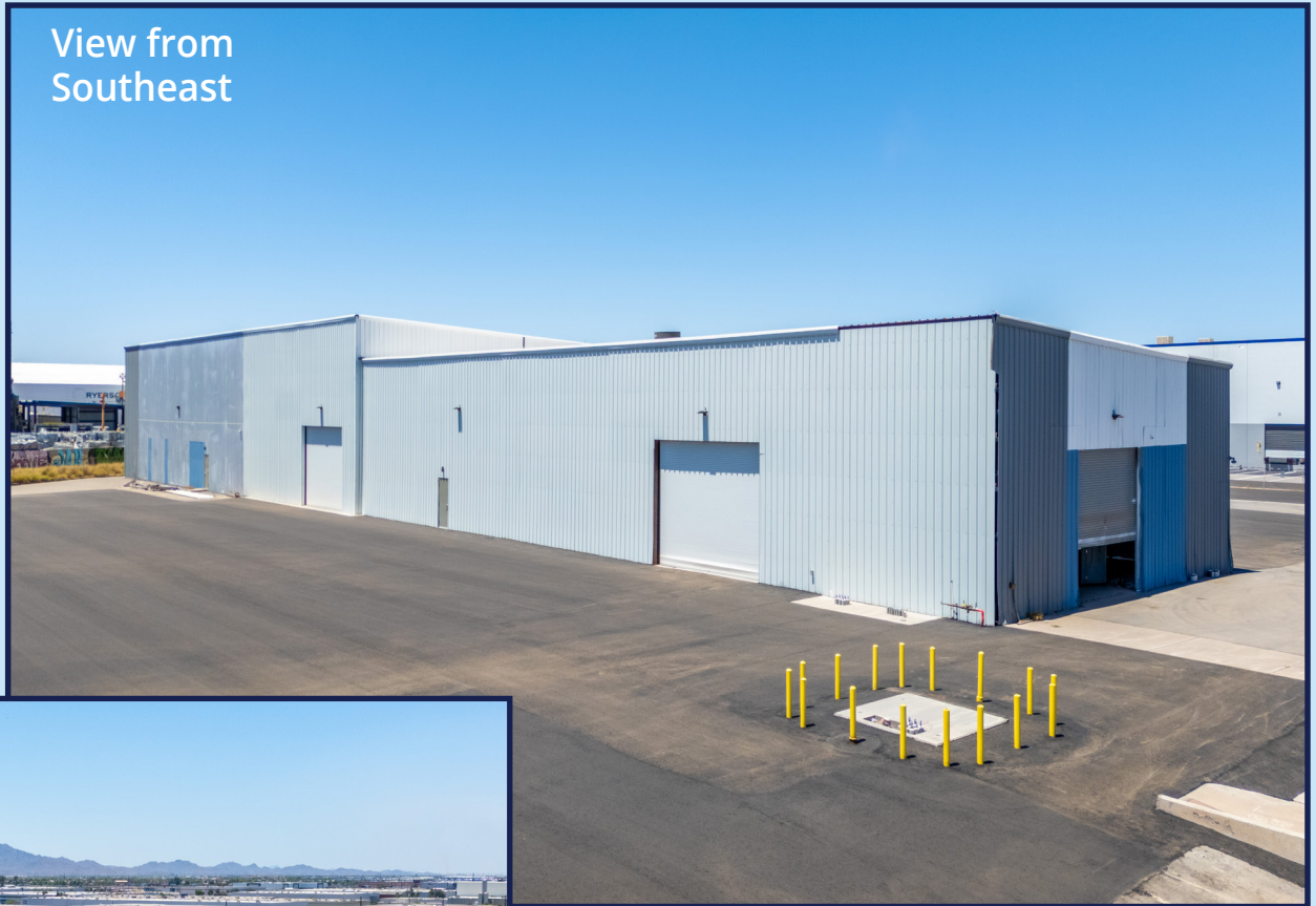
View from Southeast