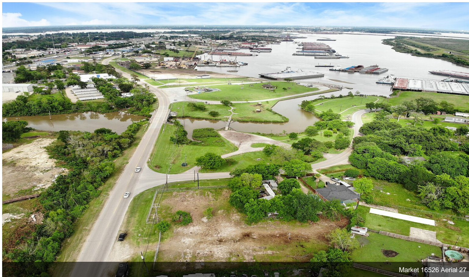
Market 16526 Aerial 27