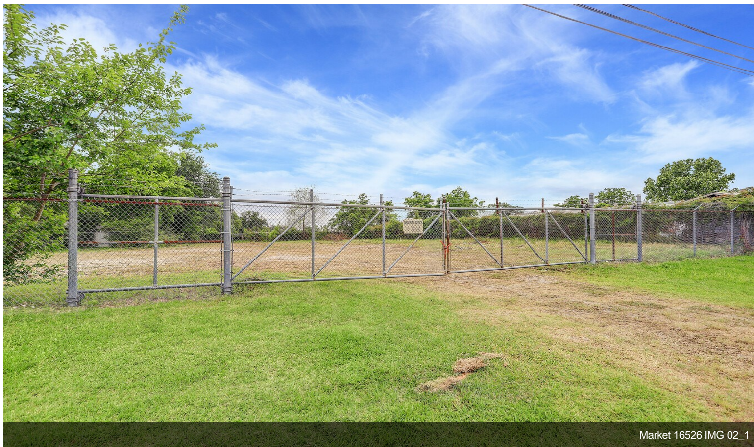
Market 16526 IMG 02_1