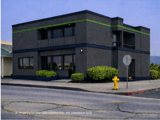
AI rendering for new color scheme only - est. completion 6/26