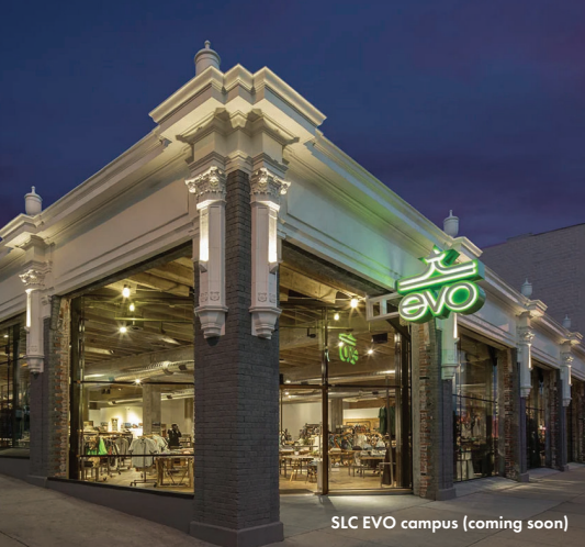
SLC EVO campus (coming soon)