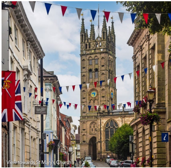
View towards St Mary's Church