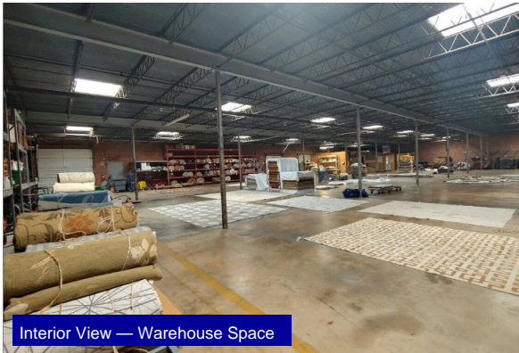
Interior View — Warehouse Space