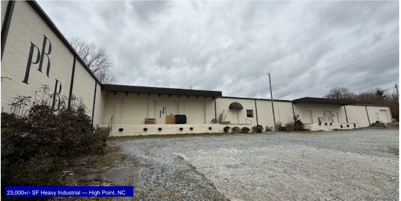
23,000+/- SF Heavy Industrial — High Point, NC