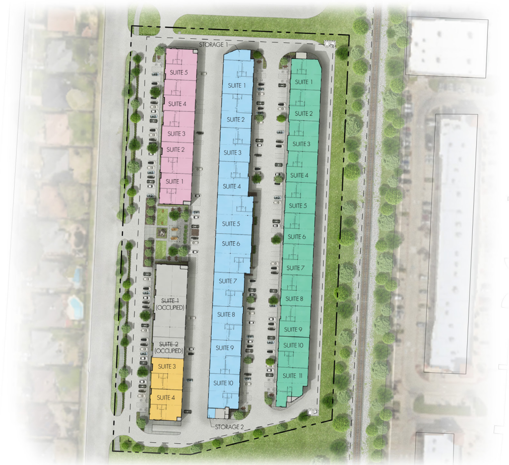
777 CHISHOLM TRAIL SITE PLAN Scale: 1" = 100'