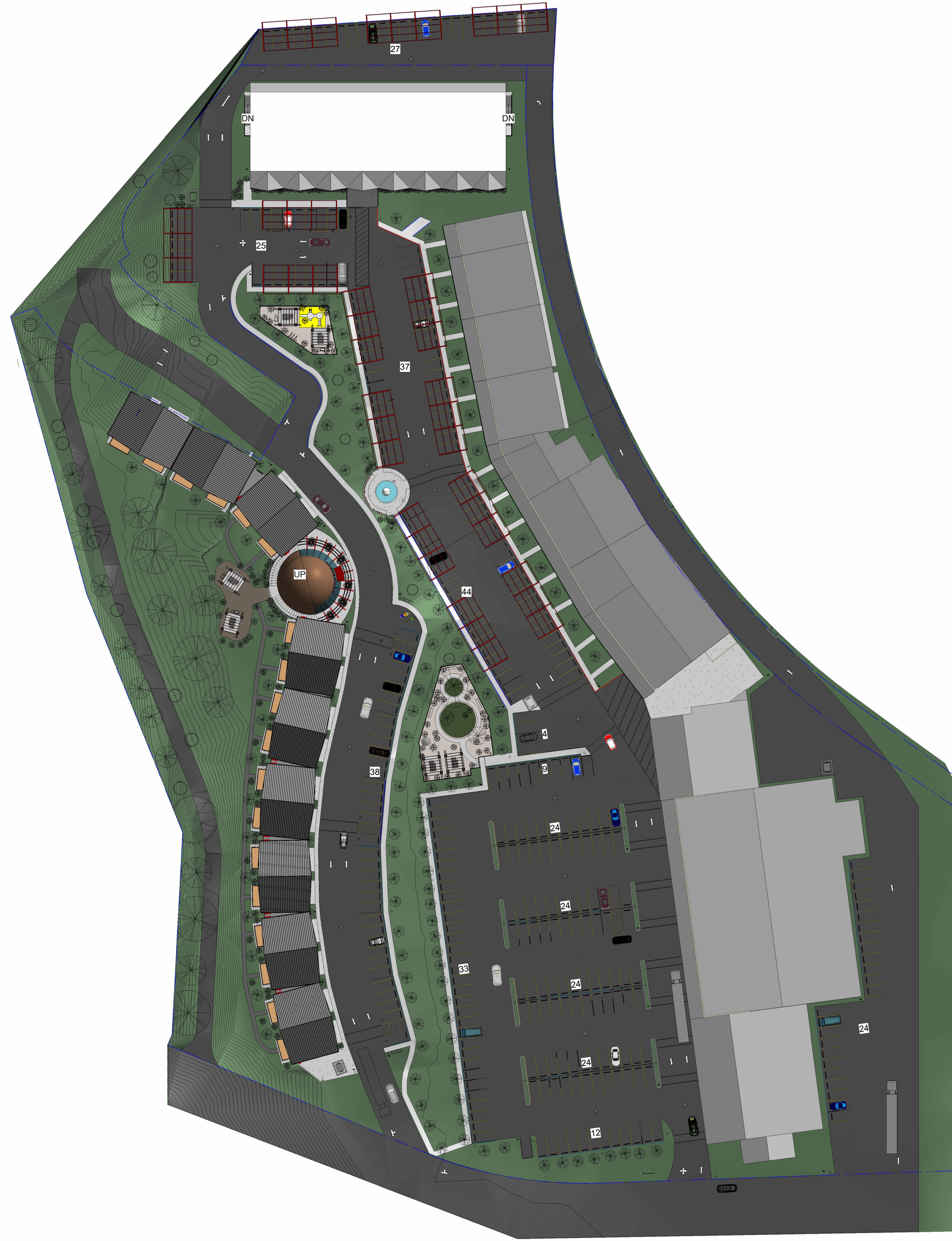
① Site Plan Landscape 1" = 50'-0"