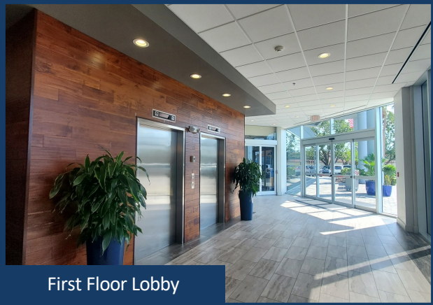
First Floor Lobby