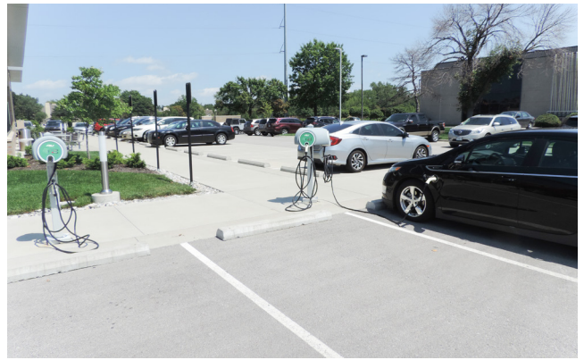
EV CHARGING STATIONS