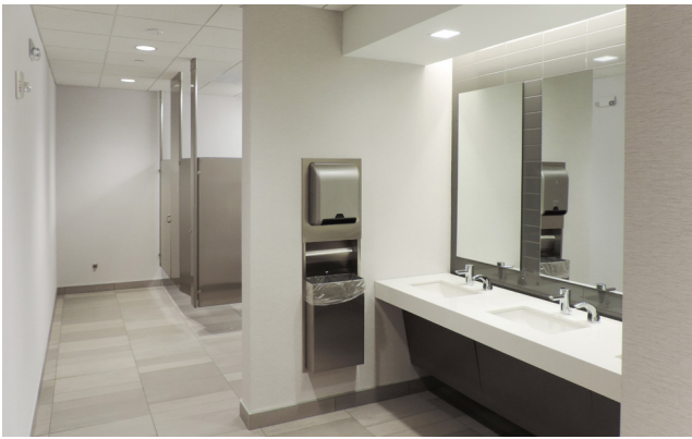
CLEAN MODERN FACILITIES