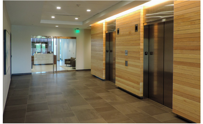
UPPER FLOOR LOBBY