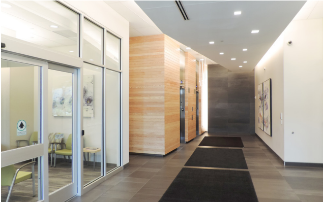
FIRST FLOOR LOBBY