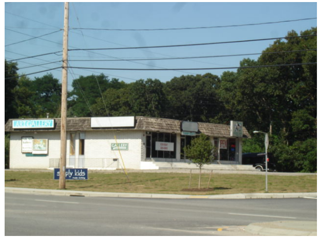
( https://images.vgsi.com/photos/WarwickRIPhotos//00/04/53/07.JPG )