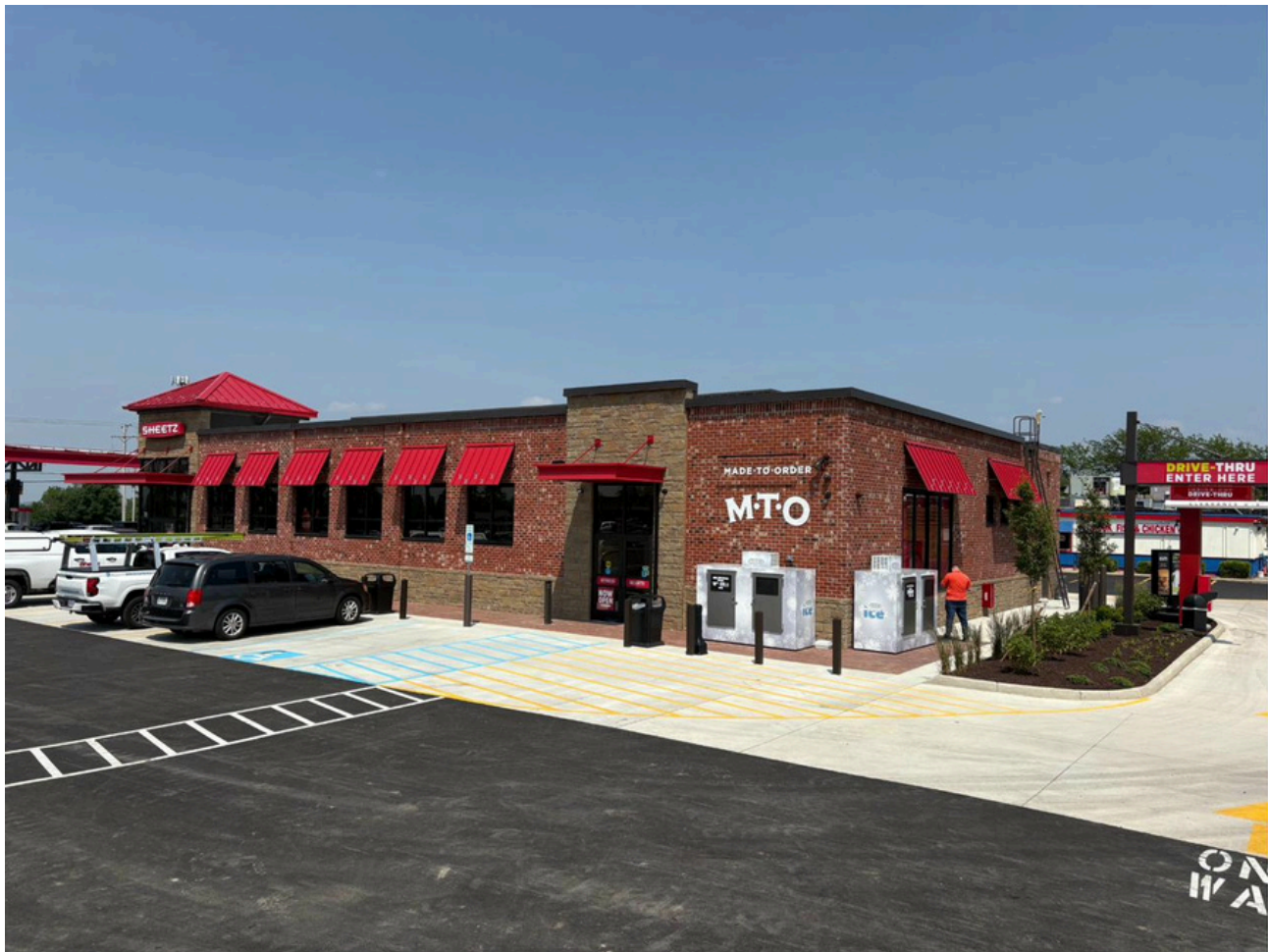
Made-To-Order (MTO) Drive-Through