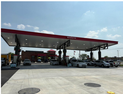
Fuel Canopy &amp; Store Exterior