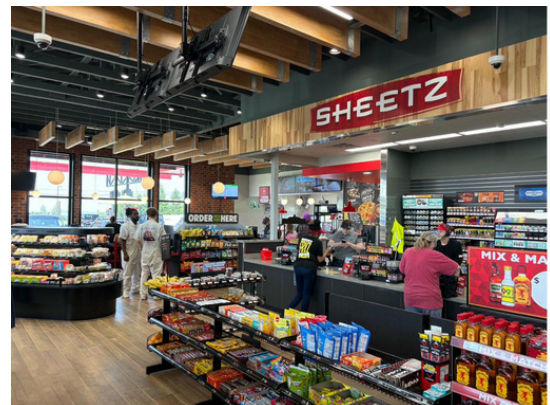
Interior — Food &amp; Beverage Area