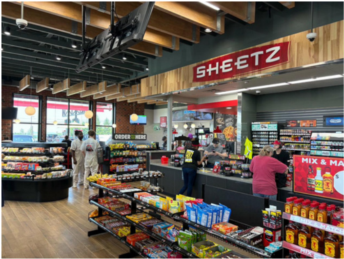
Interior — Food & Beverage Area