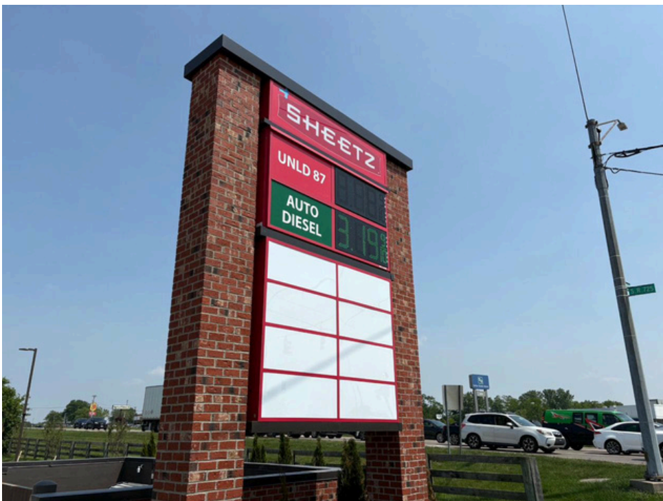
S. Alex Road Monument Sign