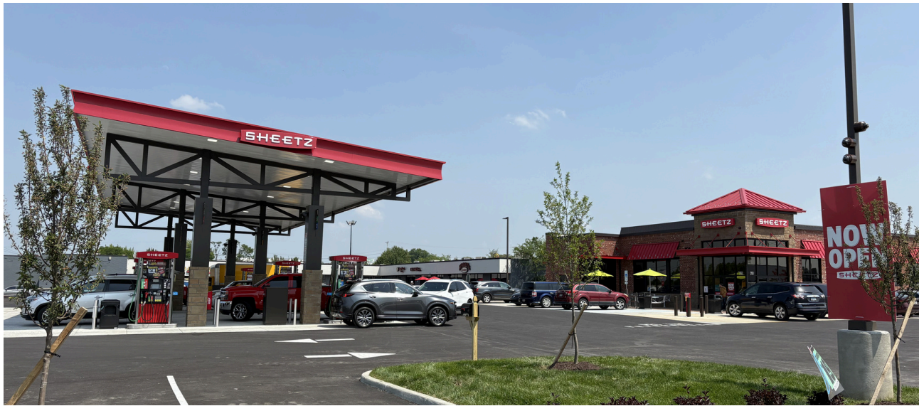
Intersection at Alex Rd.