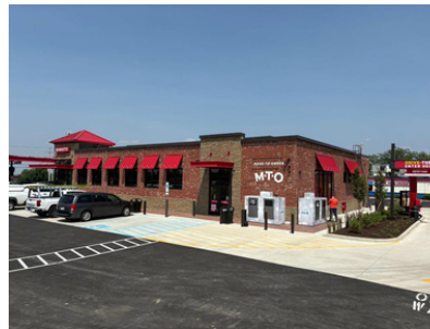
Made-To-Order (MTO) Drive-Through