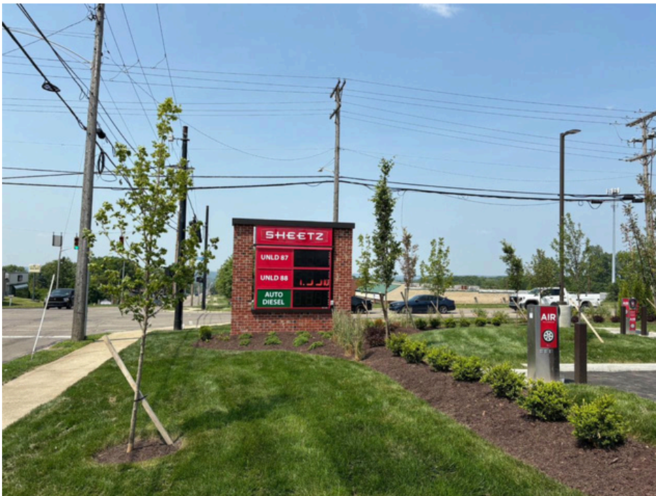
Monument Signage — S. Alex Road / Watertower Lane