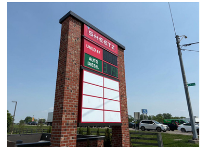
S. Alex Road Monument Sign