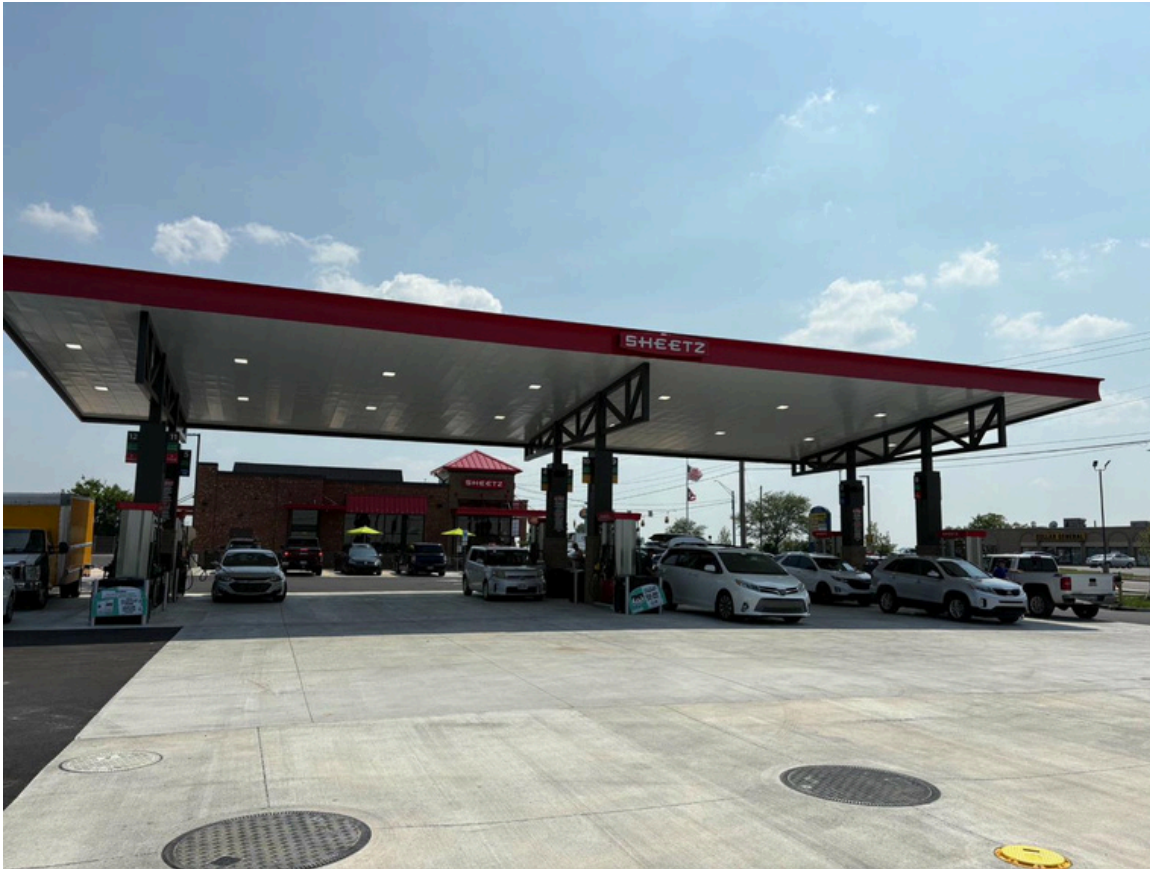
Fuel Canopy & Store Exterior