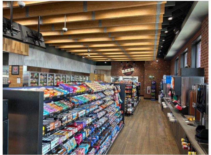
Walk-In Beer Cave & Interior Retail