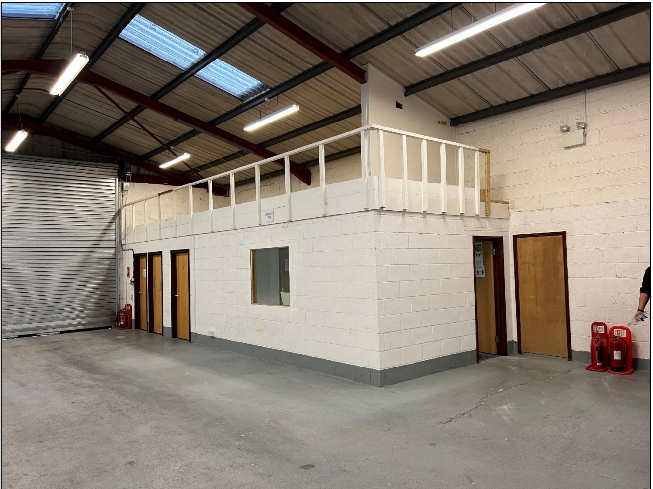
LOCATION MAPS - NOT TO SCALE