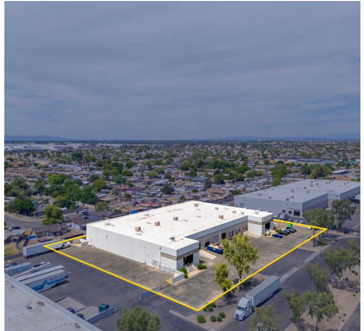
View from South End