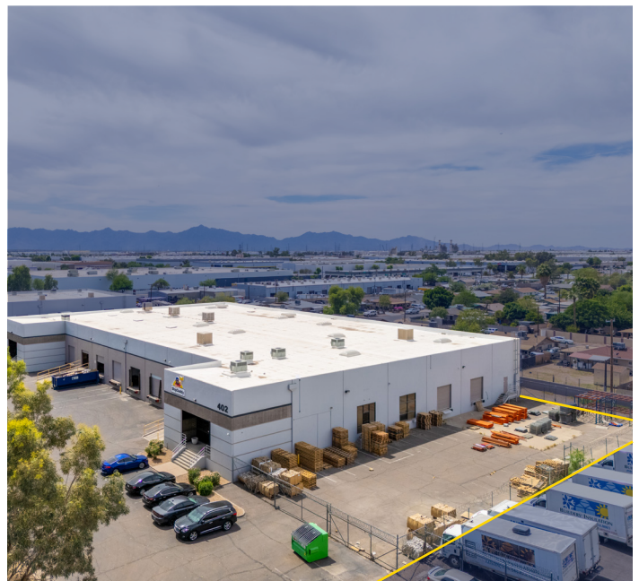
View from North End