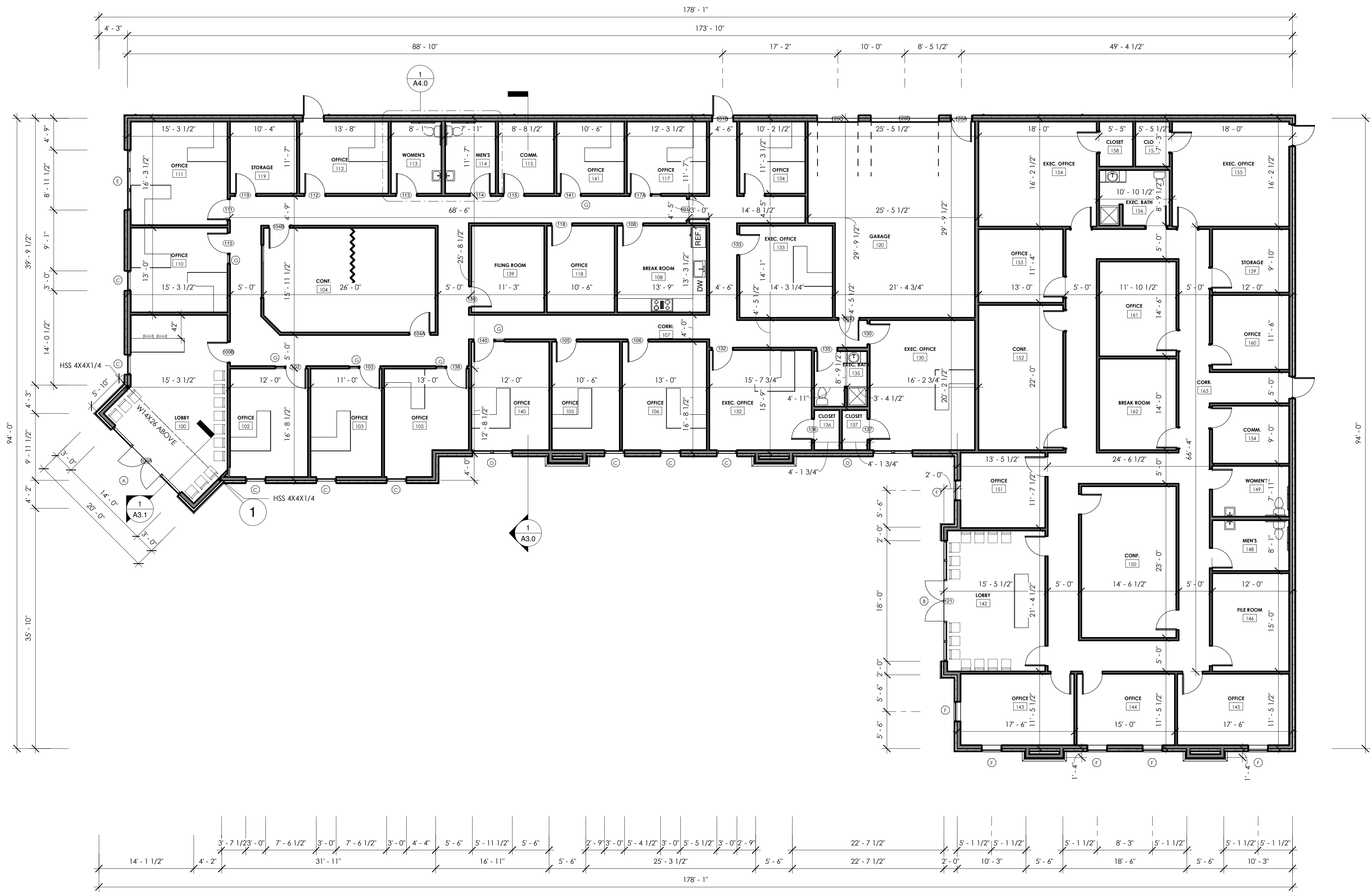
1 FIRST FLOOR PLAN 1/8" = 1'-0"