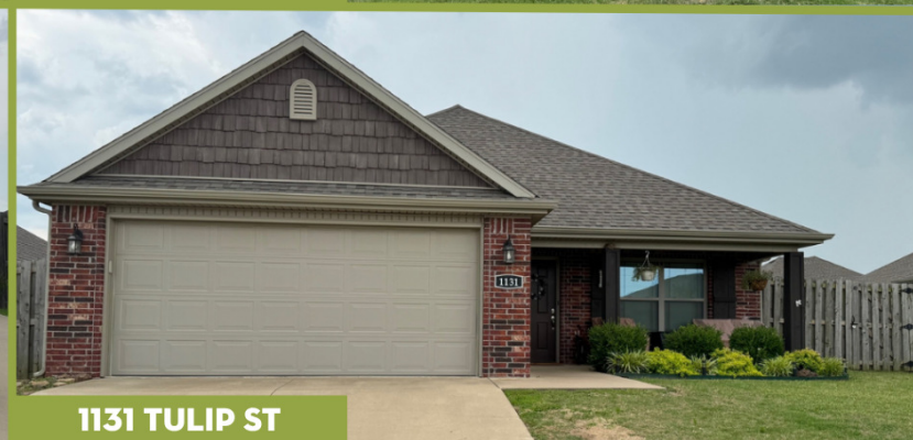
1131 TULIP ST