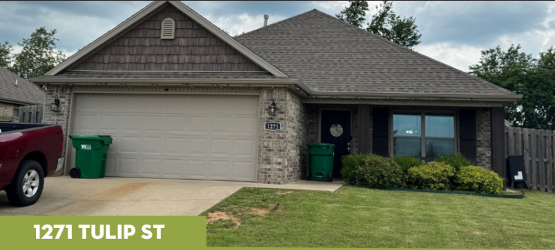
1271 TULIP ST