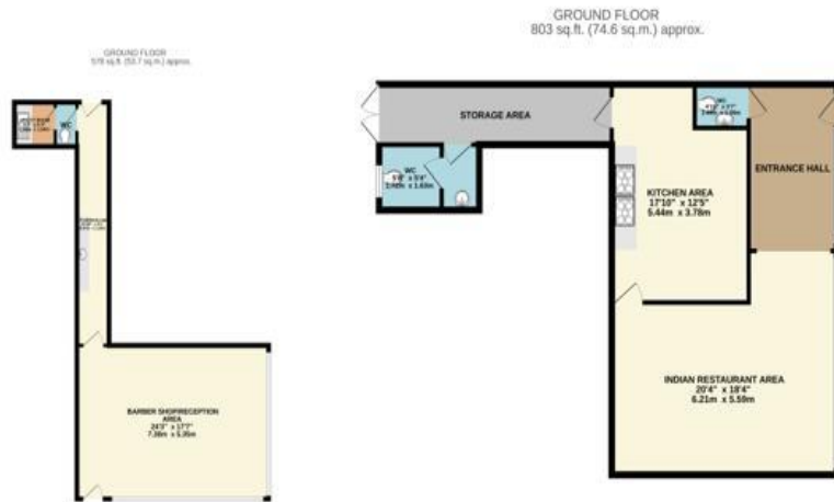
GROUND FLOOR 803 sq.ft. (74.6 sq.m.) approx.