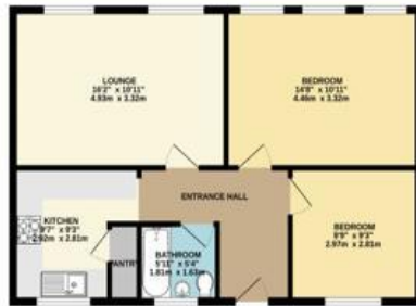
GROUND FLOOR 620 sq.ft. (57.6 sq.m.) approx.

TOTAL FLOOR AREA: 620 sq. ft. (57.6 sq.m.) approx. This is an approximate area based on the information provided by the vendor. It is not a guarantee of accuracy. The actual area may vary slightly from the stated area. The area is for guidance only and complete accuracy cannot be guaranteed. If there is any point, which is of particular importance, verification should be obtained. They do not constitute a contract or part of a contract. All measurements are approximate. We have not tested any fittings, appliances or services within the property and cannot verify them to be in working order or within the vendors ownership. No guarantee can be given with regards to planning consents or fitness for purpose or building regulations relating to the property. Items shown in photographs are NOT necessarily included. Interested parties are advised to check availability and make an appointment to view before travelling to see a property. Intended purchasers should make appropriate enquiries through their own solicitors and surveyors etc. prior to exchange of contracts.