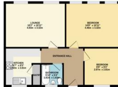
GROUND FLOOR 620 sq.ft. (57.6 sq.m.) approx.

TOTAL FLOOR AREA: 620 sq. ft. (57.6 sq.m.) approx. This is an approximate area based on the information provided by the vendor. It is not a guarantee of accuracy. The actual area may vary slightly from the stated area. The area is for guidance only and complete accuracy cannot be guaranteed. If there is any point, which is of particular importance, verification should be obtained. They do not constitute a contract or part of a contract. All measurements are approximate. We have not tested any fittings, appliances or services within the property and cannot verify them to be in working order or within the vendors ownership. No guarantee can be given with regards to planning consents or fitness for purpose or building regulations relating to the property. Items shown in photographs are NOT necessarily included. Interested parties are advised to check availability and make an appointment to view before travelling to see a property. Intended purchasers should make appropriate enquiries through their own solicitors and surveyors etc. prior to exchange of contracts.