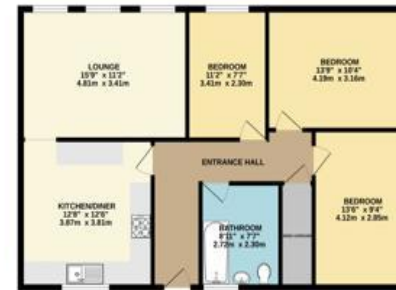
GROUND FLOOR 885 sq.ft. (82.2 sq.m.) approx.

TOTAL FLOOR AREA: 885 sq. ft. (82.2 sq.m.) approx. This is an approximate area based on the information provided by the vendor. It is not a guarantee of accuracy. The actual area may vary slightly from the stated area. The area is for guidance only and complete accuracy cannot be guaranteed. If there is any point, which is of particular importance, verification should be obtained. They do not constitute a contract or part of a contract. All measurements are approximate. We have not tested any fittings, appliances or services within the property and cannot verify them to be in working order or within the vendors ownership. No guarantee can be given with regards to planning consents or fitness for purpose or building regulations relating to the property. Items shown in photographs are NOT necessarily included. Interested parties are advised to check availability and make an appointment to view before travelling to see a property. Intended purchasers should make appropriate enquiries through their own solicitors and surveyors etc. prior to exchange of contracts.