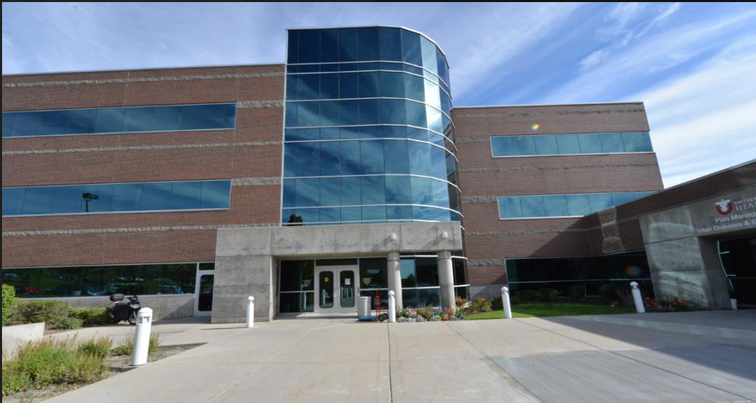
675 ARAPEEN | UNIVERSITY OF UTAH RESEARCH PARK | SALT LAKE CITY, UT