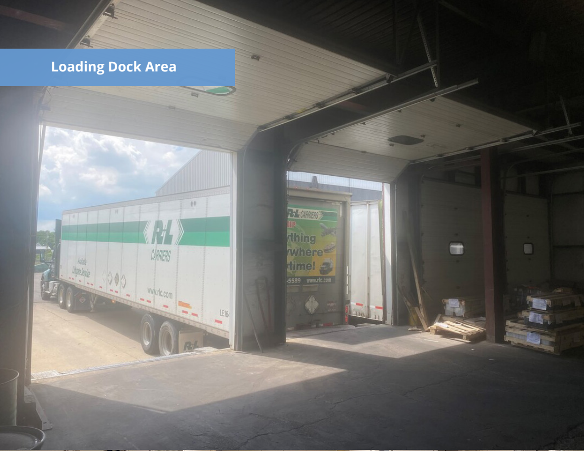
Loading Dock Area