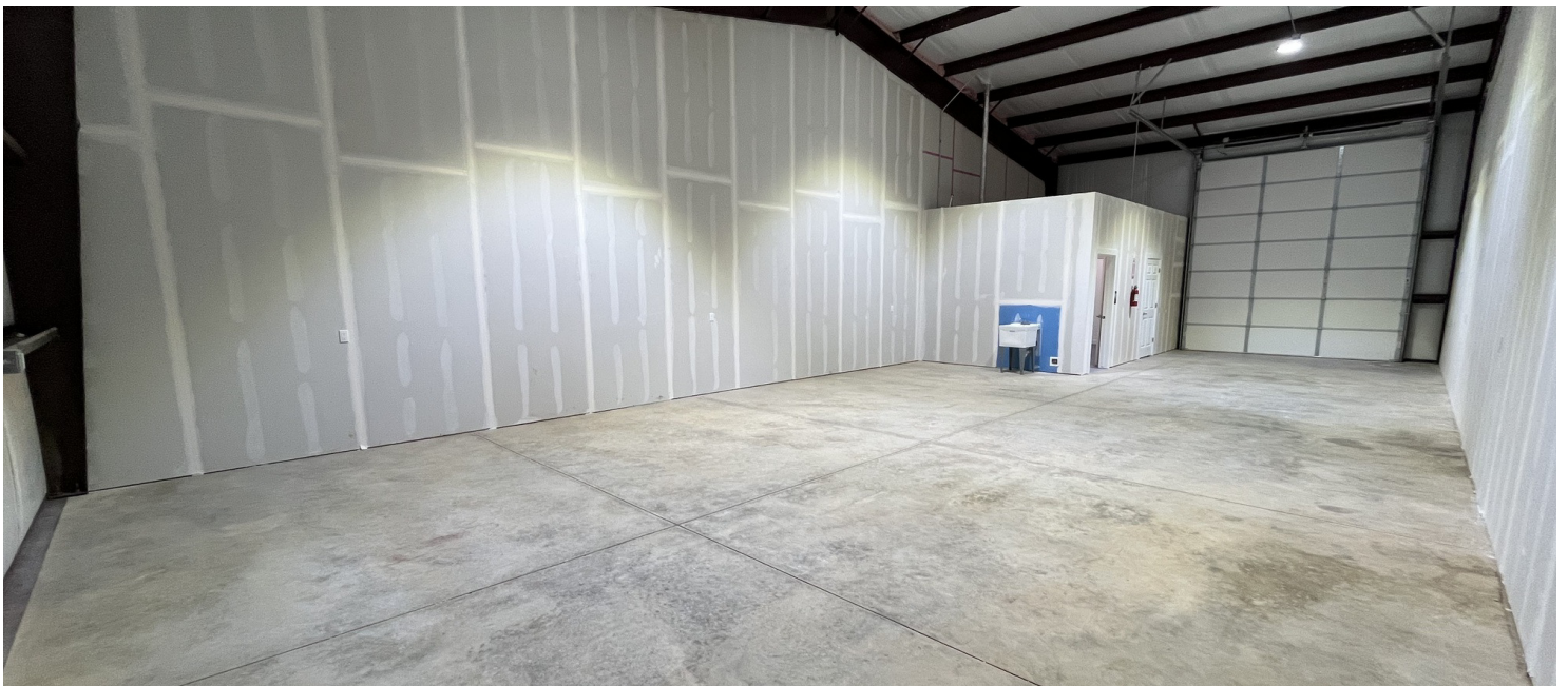
Interior of Warehouse