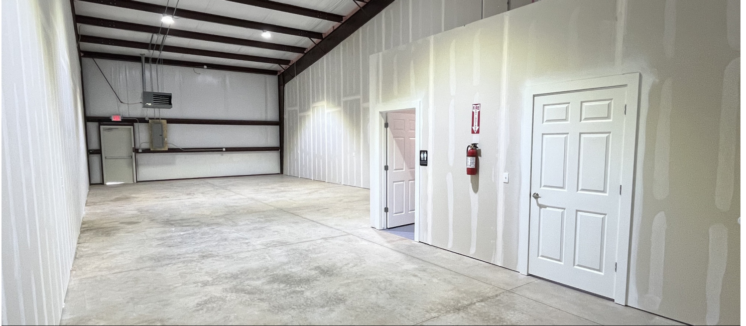
Interior of Warehouse