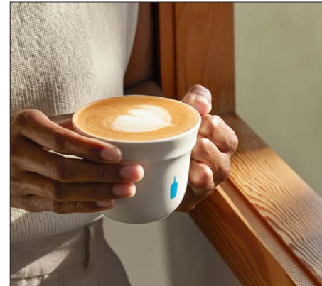
BLUE BOTTLE COFFEE