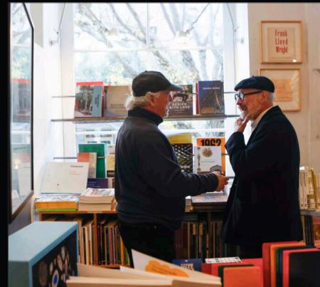
WILLIAM STOUT ARCHITECTURAL BOOKS