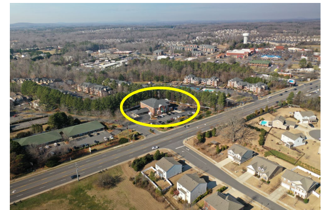
100 Stone Village Drive