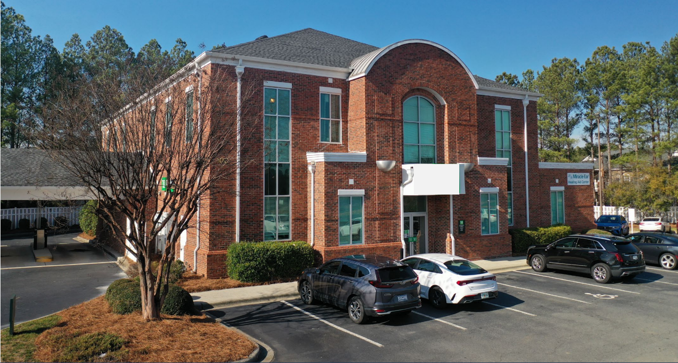
Stone Village Park