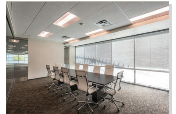
Conference Room in Second Floor Spec Suite