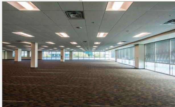
Interior Office Space