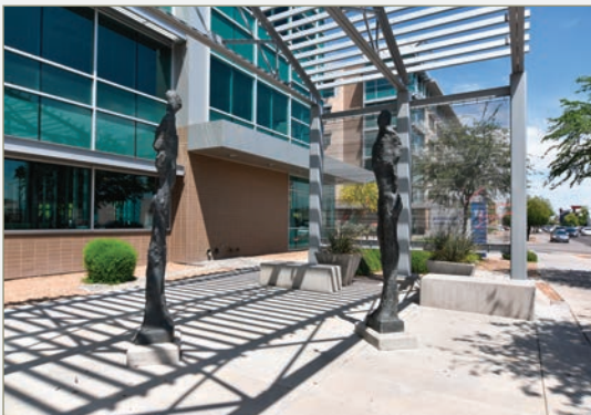
Art Sculptures Facing Seventh Avenue

Suite 110 8,891 SF Suite 200 (Full Floor Spec Suite) 24,123 SF Suite 300 24,123 SF