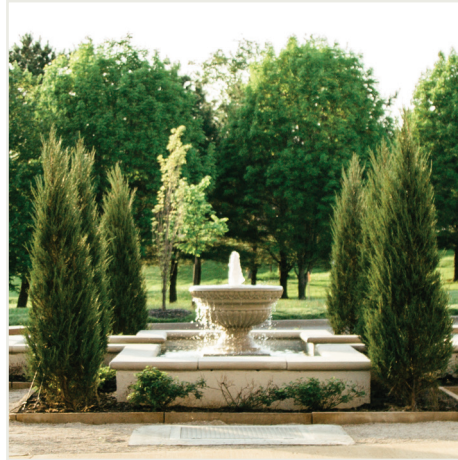
Fountain Area in the Community Plaza