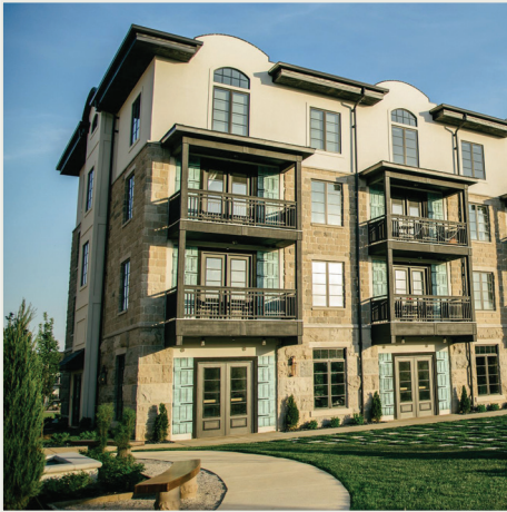
1 st Floor Commercial Space opens onto Community Plaza

9500 SQ FT | RETAIL • OFFICE • RESTAURANT | HIGH VISIBILITY & TRAFFIC COUNTS | AMPLE PARKING | BRAND NEW IN 2017