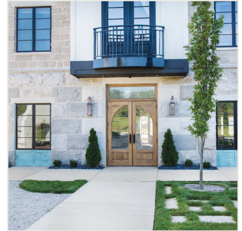
Stunning Storefronts with Manicured Landscaping

Schedule Your Tour Today CALL CHRIS SMITH • (812) 219 - 3030