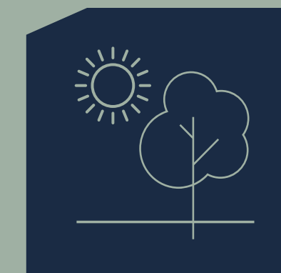
Attractive Public Areas

The Placette: the perfect place to get together and unwind