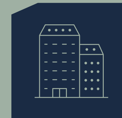
Residential Units: Condos and Rentals