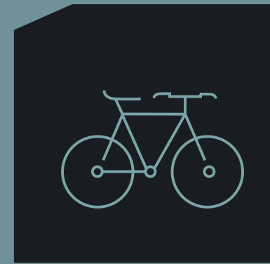
Secure Bicycle Parking