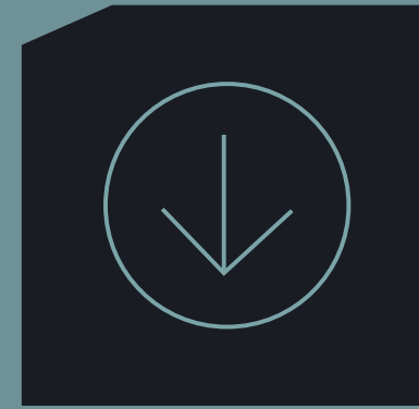
Papineau Metro Station