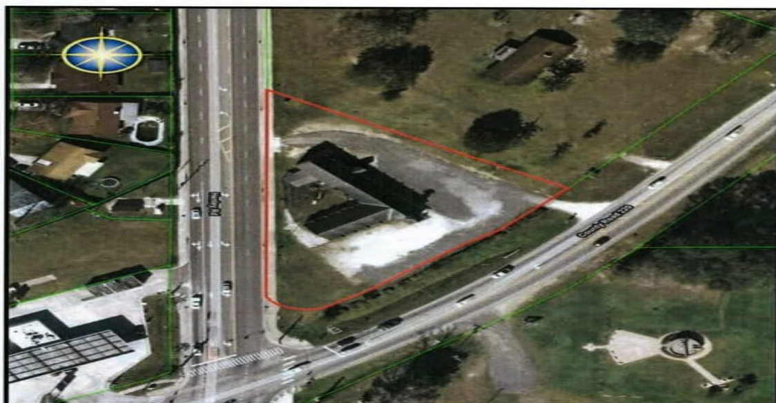
Aerial Photograph: