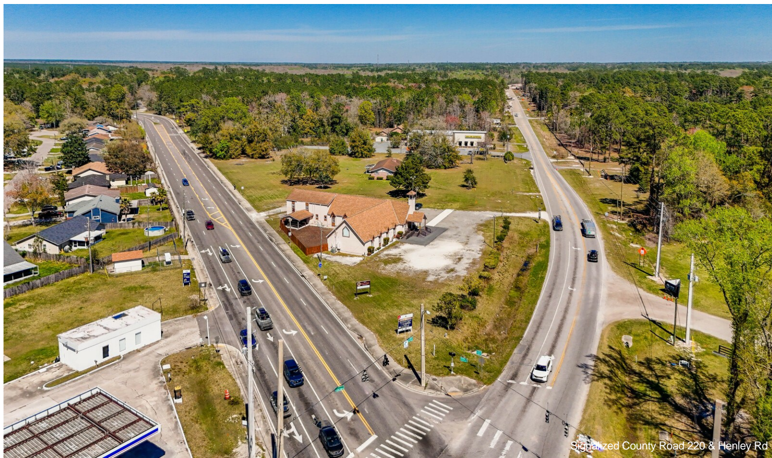
Signalized County Road 220 & Henley Rd